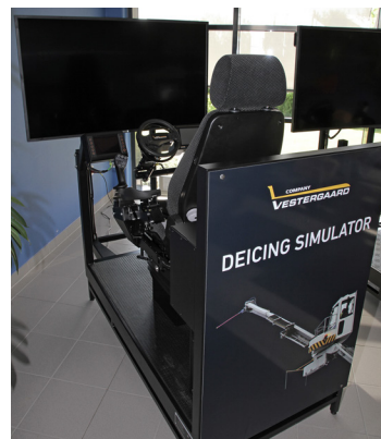
Full cabin mock-up version.

The Elephant® Beta simulator is a state-of-the-art PC-based training tool.