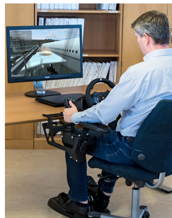
Transportable table version.